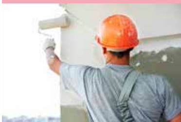
SP200 Print Base