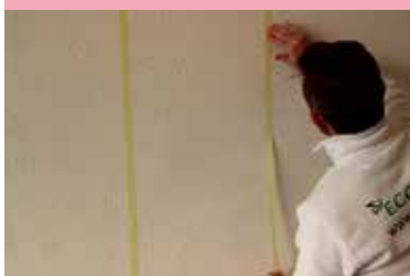
Exploded tape on the facade