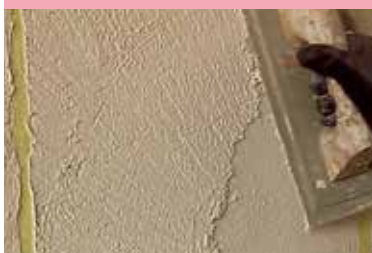
GM8 trowel application